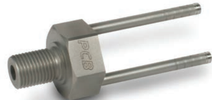
064B02 Water Cooled, Flush Mount