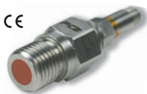
Series CA102B Ablative coating option 'CA' available for flash protection