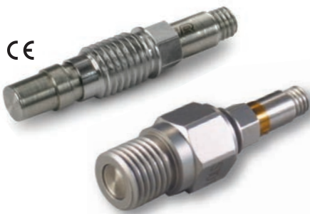
Model 113B / 102B High Frequency Pressure Sensors

As with all PCB® instrumentation, these sensors are complemented with toll-free applications assistance, 24-hour customer service, and is backed by a no-risk policy that guarantees satisfaction or your money refunded.